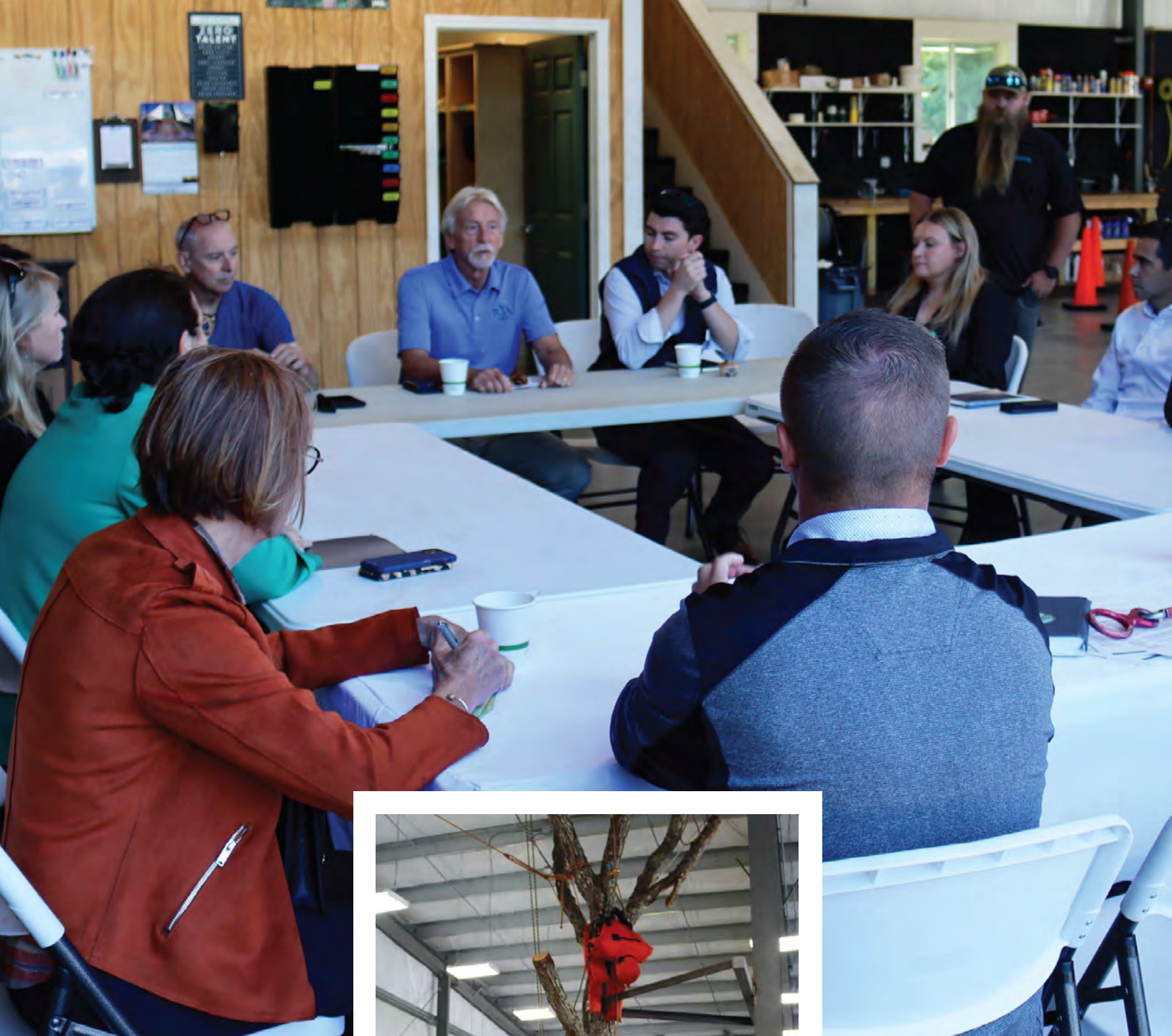
Congressional site visit to highlight the challenges that tree care companies face at ArborTech in New Hampshire. See next page for details.